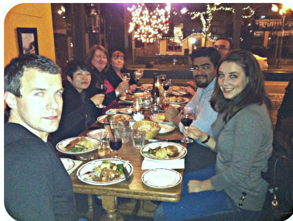
Canada's West Marketplace FAM, November 2011